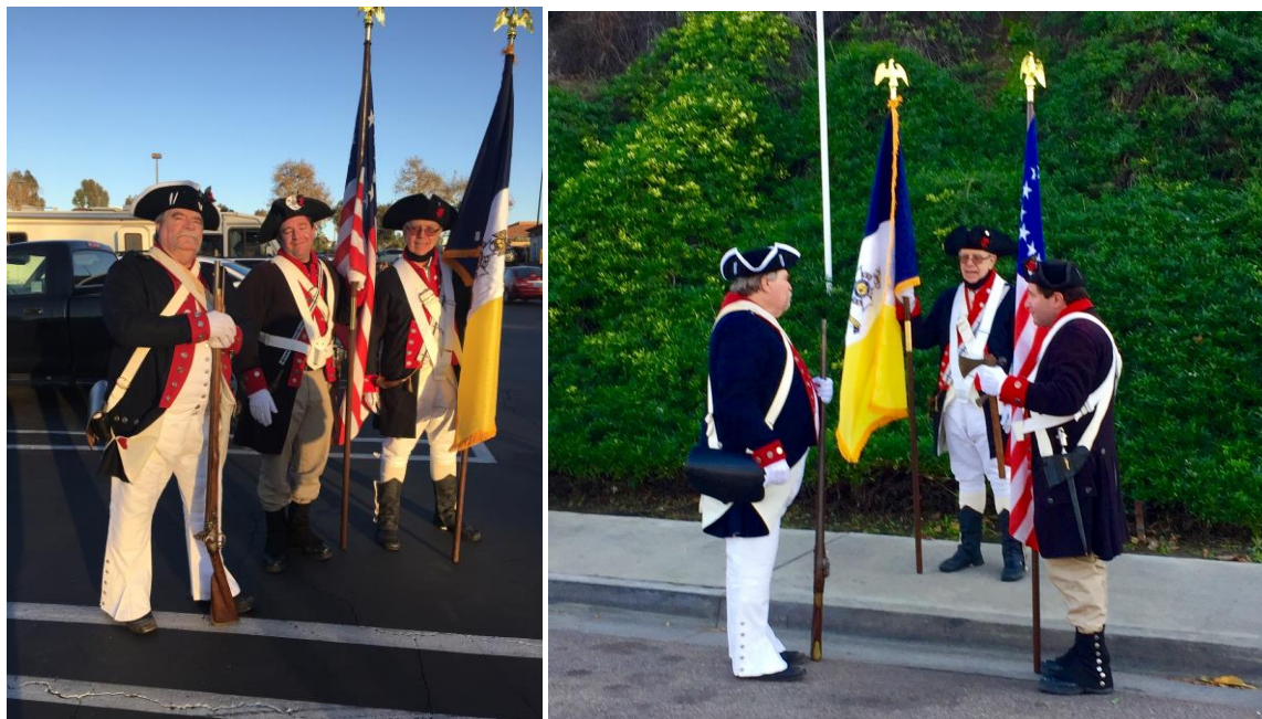
EAGLE COLOR GUARD, MUSKET WITH AMERICAN AND SAR FLAGS